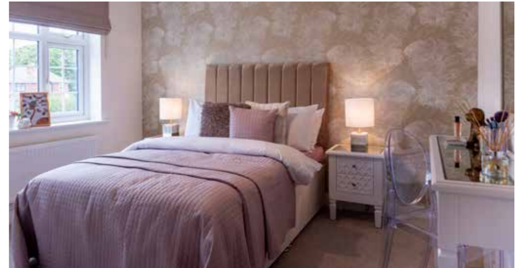
Images from Broadmeadow Park show home